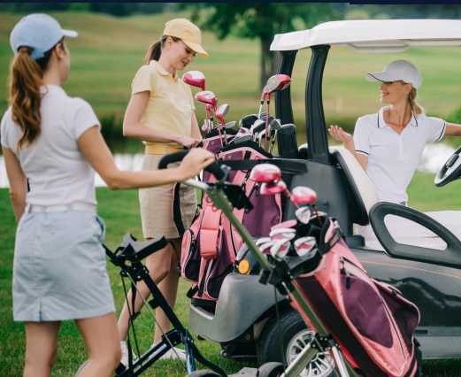
Golf and Tuition