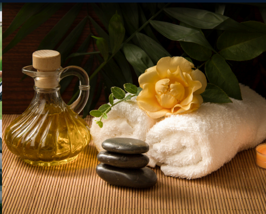
Lunch, Wine & Spa